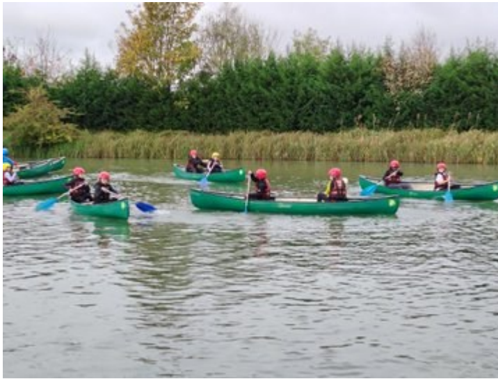
Yr6 Residential - Oct 25

Visits and visitors play an important part. Both local day visits to places of interest, and residential visits further afield are important. There is an opportunity to take part in a residential visit in Year 6.