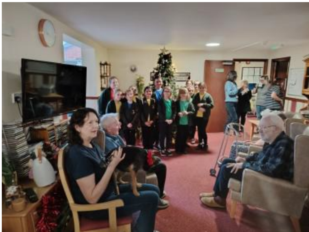
Our Supersingers choir performing at a local care home.